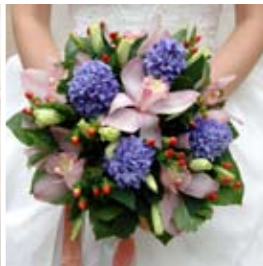
DESCRIBE YOUR WEDDING STYLE