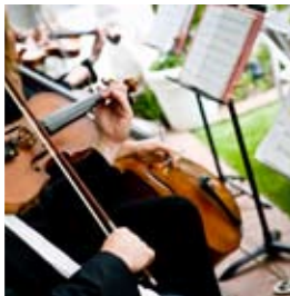
SHARE YOUR FAVORITE VENDORS