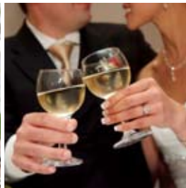
LIVE HAPPILY EVER AFTER