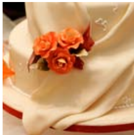
GIVE EVERY DELICIOUS DETAIL